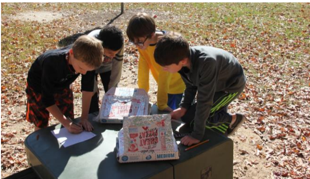
Constructing Solar Ovens out of Pizza Boxes