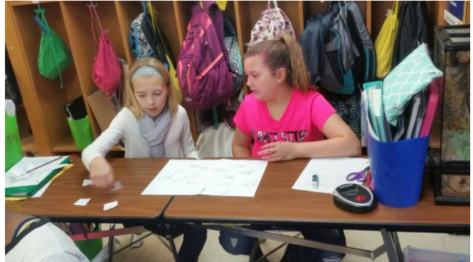
Team work classifying polygons in a hierarchy chart.

We will begin this quarter with geometry concepts as well as order of operations. In an effort to keep on pace this quarter 3 days a week we will be doing 2 math lessons. Please have your child redo errors in math. I will re-grade them if the students take the time to make the proper corrections. They must write an explanation as to why they made the error for each problem. I look very favorably upon those that redo work they have made error on. A good game to be playing right now to help with the coordinate grids coming up is Battleship . This game will help with the concept and make it fun.